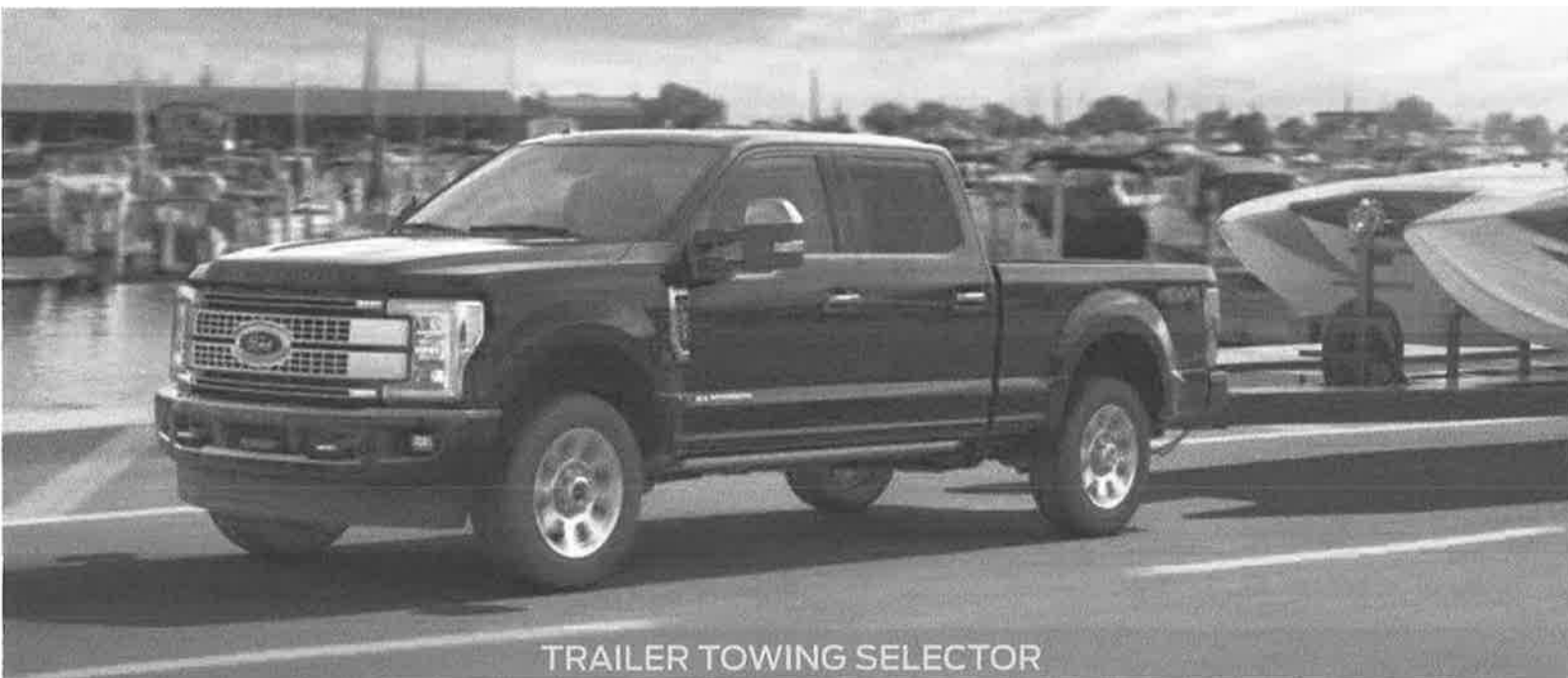
TRAILER TOWING SELECTOR